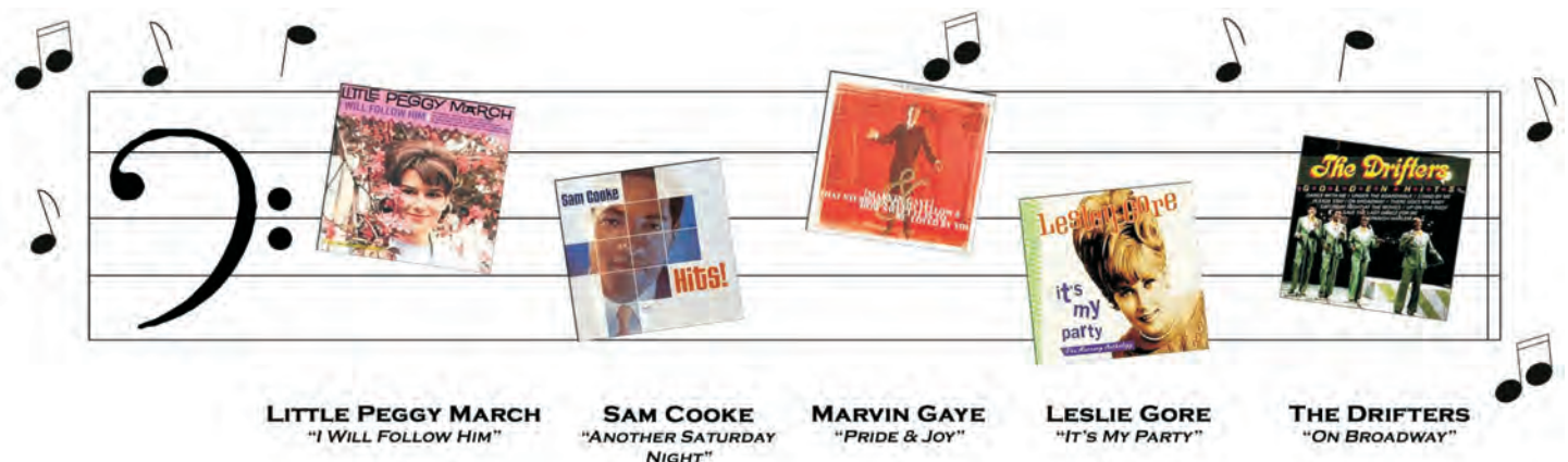
LITTLE PEGGY MARCH "I WILL FOLLOW HIM"